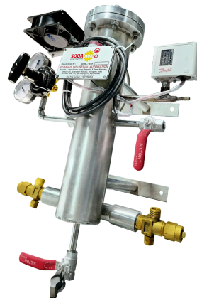
2-STAGE GAS BANK