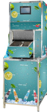
6 BPM GOLI SODA FILLING MACHINE