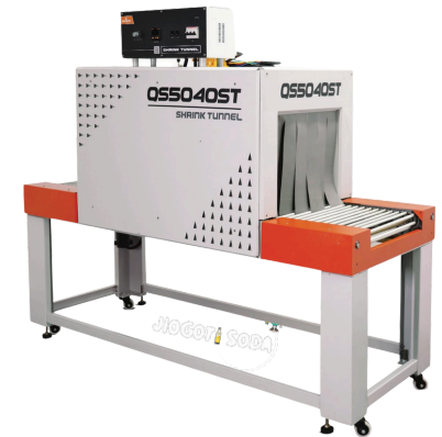
SHRINK LABEL MACHINE