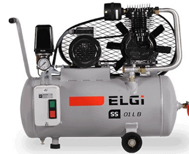
AIR COMPRESSOR COMPROS 1 HO SINGLE PHASE